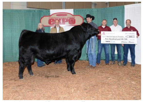
2018 Supreme Champion Bull – AORB lot 705, 3G Double Booked 6116D a Limousin Flex, October 2016 bull was consigned by 3G Ranch of Kendallville, IN.

E. LANSING – High quality cattle, friendly competition and rapid bidding made the 29<sup>th</sup> Annual Michigan Beef Expo a success for Michigan's cattle industry. As the state's largest cattle industry event, the Michigan Beef Expo included seedstock shows and sales for the Angus, Hereford, Chianina, Maine-Anjou, Shorthorn, Simmental and all other registered breeds (AORB's). A trade show with over 50 vendors featured a wide variety of cattle industry equipment, services and supplies. The MSU Block & Bridle Club hosted a youth livestock judging competition on Friday night with 100