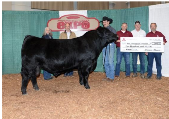
2018 Supreme Champion Bull – AORB lot 705, 3G Double Booked 6116D a Limousin Flex, October 2016 bull was consigned by 3G Ranch of Kendallville, IN.

E. LANSING – High quality cattle, friendly competition and rapid bidding made the 29 th Annual Michigan Beef Expo a success for Michigan's cattle industry. As the state's largest cattle industry event, the Michigan Beef Expo included seedstock shows and sales for the Angus, Hereford, Chianina, Maine-Anjou, Shorthorn, Simmental and all other registered breeds (AORB's). A trade show with over 50 vendors featured a wide variety of cattle industry equipment, services and supplies. The MSU Block & Bridle Club hosted a youth livestock judging competition on Friday night with 100 youth participating along with the MSU livestock judging team, and a Junior Steer and Heifer show on Saturday with over 500 cattle entered. MI Shows sponsored a youth education contest with over 40 individuals competing in essay, photograph, graphic design, stockman or salesmanship contests.